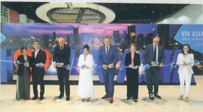
VIV Asia 2025 wraps up: A landmark event showcasing industry excellence and market leadership