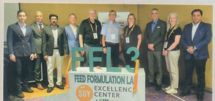
SOY EXCELLENCE CENTER: USSEC's Skill-Building Initiative for Poultry, Aqua, Livestock & Food Sectors