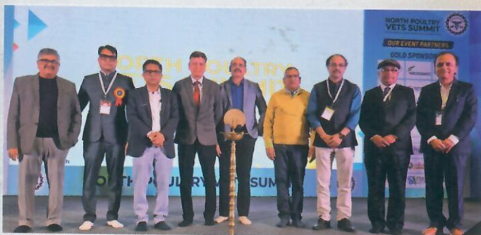
North Poultry Vets Summit 2025: A Historic Gathering of North India's Poultry Veterinarians