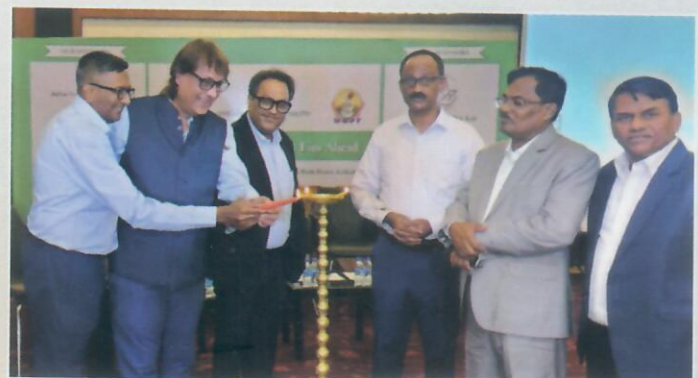
CLFMA of India Poultry Seminar along with US Grains Council & West Bengal Poultry Federation at Kolkata