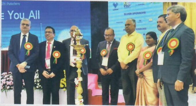
WVPA India Conference 2025 Successfully Concludes in Puducherry, Driving Innovations in Poultry Health