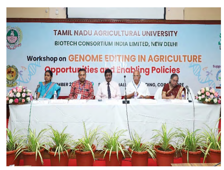
Speakers at the workshop in Coimbatore (November 29, 2022).