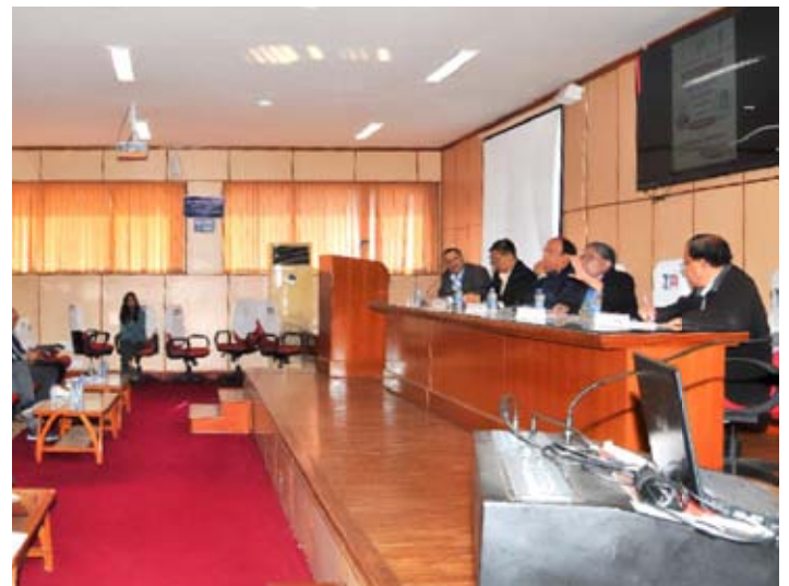
Speakers at the workshop (19 December 2023).