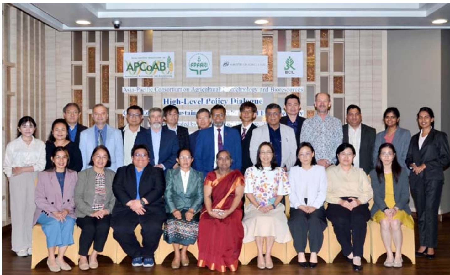
Participants at the High-Level Policy Dialogue on Gene Editing for Sustainable Agriculture and Food Security in the Asia Pacific Region (11 December 2023).