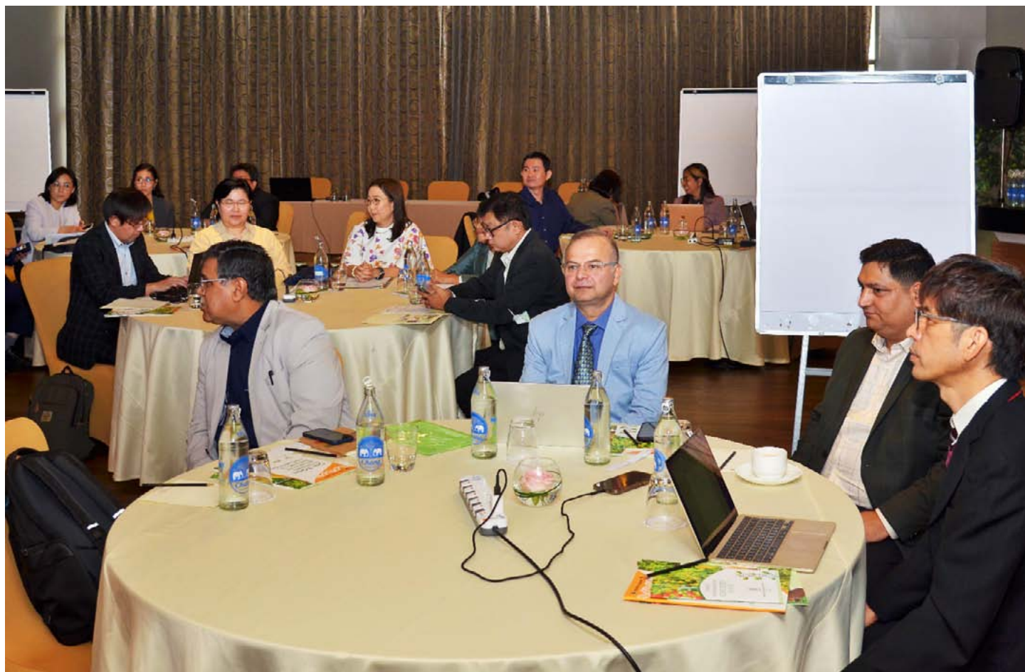
Participants at the High-Level Policy Dialogue on Gene Editing for Sustainable Agriculture and Food Security in the Asia Pacific Region (11 December 2023).

Participants deliberated on strategies for the development and commercialization of gene edited products in the Asia Pacific region. They had in-depth discussions on capacity building requirements, institutional strengthening and human resource development, international linkages, collaborations and partnerships, and communication strategies.