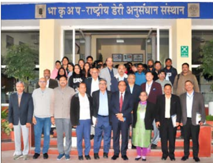
Speakers and participants at the workshop (19 December 2023).

There was a panel discussion and interactive session with experts from institutions and industry associations, along with representatives of ICAR institutions engaged in livestock research, the state government, and progressive farmers. A total of 74 participants from research institutions, government, and industry (livestock sector and leading feed producers) attended this workshop.