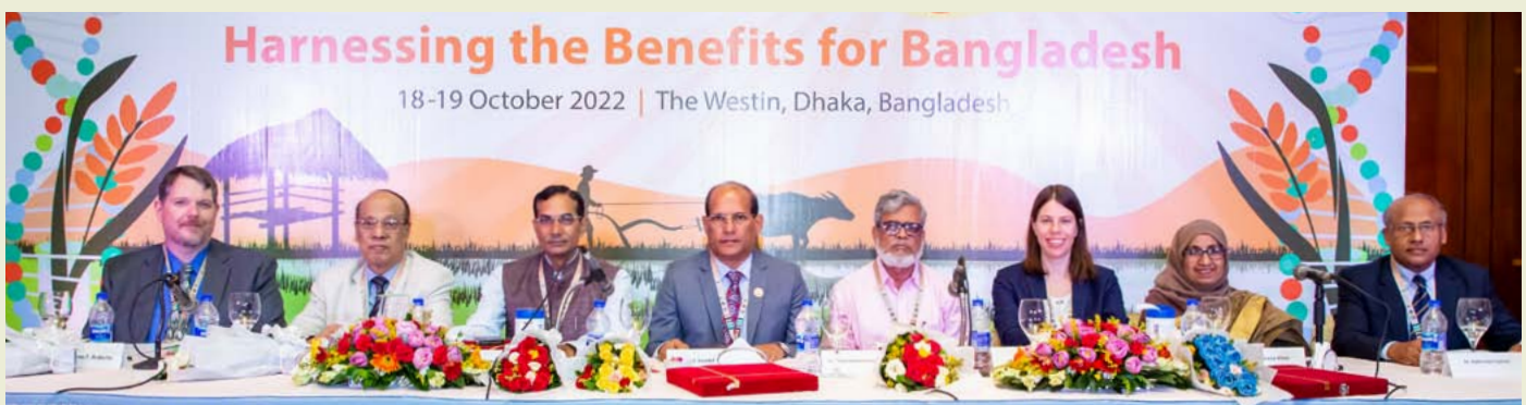
Guests and organizers at the Conference on Genome Editing in Plants: Harnessing the Benefits for Bangladesh (18 October 2022)